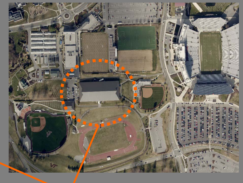
Rector Field House